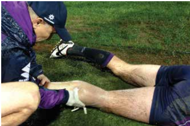
Figure 1. A rugby league football player with a history of EAMC receives soft tissue therapy/massage for treatment of EAMC during the second half of a game.