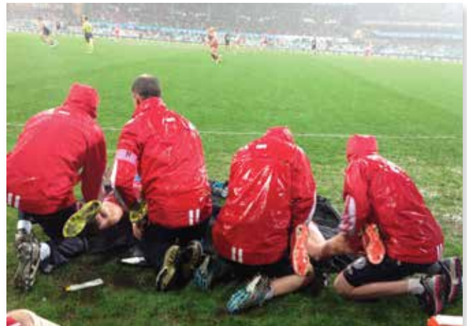
Figure 2. Two AFL players receiving soft tissue massage as a preventive measure for EAMC.

proposed ingredient that elicits the decrease in cramp duration is acetic acid.